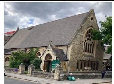
Church G South Croydon United Church 7 Aberdeen Rd. CR0 1EQ

Check out the tiling of the walls in The Store bar. A very early Sainsbury with counter service