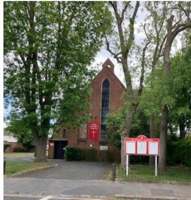
Church E St George's Church Centre Barrow Road CR0 4EZ

Figure 7. Waddon is at the western edge of Croydon, and its geographical boundary is larger than the political Waddon ward. Waddon has an older area with 19th-century properties, some even older, close to central Croydon. Further south is a large estate of Council-owned and former Council-owned homes and a small number of tower blocks. In the inter-war years, Waddon had the most Croydon Corporation owned homes in Croydon, with 1,125 council houses and 80 council flats.