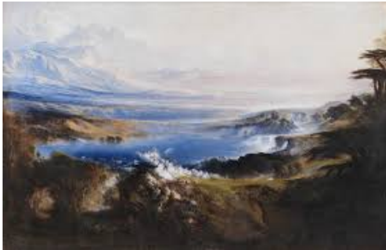
“The Plains of Heaven” by John Martin (Tate Britain)

Coronation Ceremony: The highlight of the journey is the welcoming reception and coronation which awaits each new arrival. “There is laid up for me a crown of righteousness, which the Lord, the righteous judge , shall give me at that day; and not to me only, but unto all them also that love His appearing.” (1 Timothy 4:8)